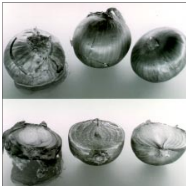
Figure 1. B. cepacia causes an onion rot known as slippery skin (1). The onions shown were inoculated with three strains of B. cepacia . Rot occurred in onion 1 (left), which was inoculated with strain originally isolated from onions. Rot did not occur with environmental isolates tested or with strains from CF lung.

Address for correspondence: Alison Holmes, Department of Infectious Diseases, Hammersmith Hospital, Du Cane Rd, London W12 0NN, United Kingdom; fax: 44-181-383-3394; e-mail: aholmes@rpms.ac.uk.