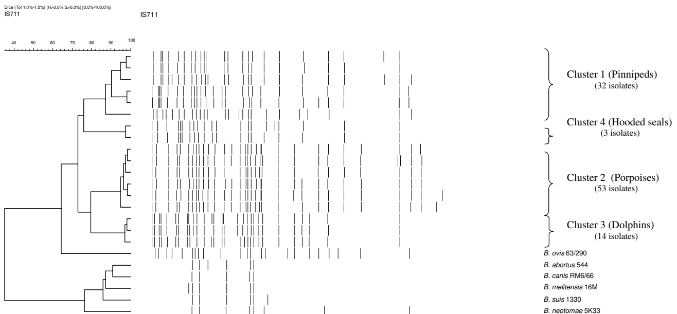
Figure 1 Representation of examples of full IS711 fingerprints of Brucella isolates from marine mammal and reference strains.

In this study, isolates originating from seals (corresponding to IS711 fingerprinting cluster 1) in general showed a requirement for CO 2 for growth whereas isolates from