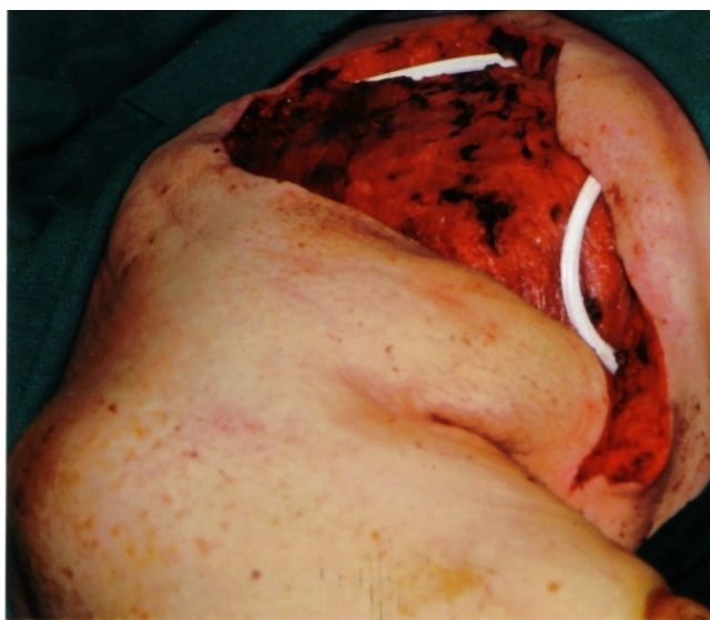
Figure 3 Case 1: Intra-operative photo after tumor resection with placement of two #19 Blake drains under the superior and inferior flaps.

bland stroma (Fig 4D). The margin of resection was negative for the tumor with a tumor-free zone that ranged from 0.3 to 1.0 cm (Fig 4E). The Ki67 proliferation index of the tumor from patient A was 5 and 13 for the epithelial and stromal component, respectively (Fig 4F). The epithelial component Ki67 index from this specimen is typical of adenomas, whereas the index of 13 for the stromal component is consistent with benign yet brisk stromal proliferation. Mitoses were less than 3 per 10 high power field. Three axillary lymph nodes were present within the mastectomy specimen, and none of these showed evidence of malignancy. The patient is currently over 7 years post-surgery and has shown no evidence of local recurrence or distant metastasis.