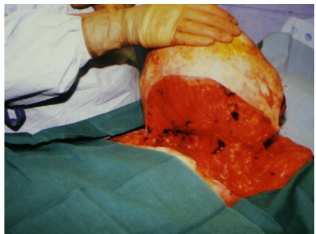
Figure 2 Case 1: Intra-operative photo revealing dissection of the tumor with no invasion of the deeper chest wall.

The pathologic findings of this procedure were consistent with benign phyllodes tumor. The tumor measured 30.0 × 25.0 × 20.0 cm ex vivo . Microscopic sections demonstrated large, simple ducts surrounded by a uniform,