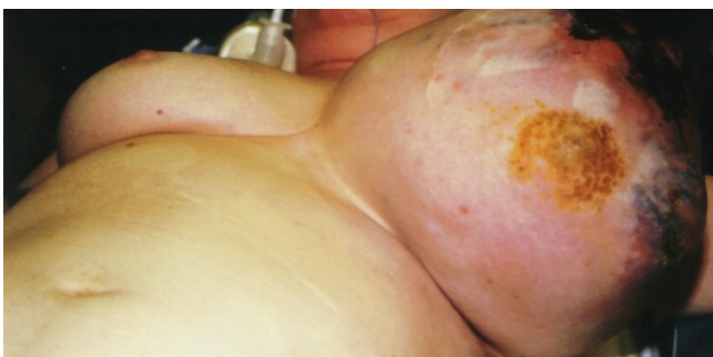
Figure 1 Case 1: The mass measured 36 × 30 cm with the characteristic bluish discoloration of the skin with nipple excoriation.

Physical exam revealed a well-nourished female with an obvious mass of the right breast. The mass measured 36 × 30 cm at the time of presentation. The skin of the breast was blue at the apex of the mass, and the nipple was massively enlarged and excoriated (Fig 1). On initial presentation, there was no evidence of skin breakdown, but by the time of surgery, the patient had experienced loss of skin integrity. The contralateral breast was of normal size, with no significant masses on palpation. There was no palpable adenopathy in either of the axillary basins.