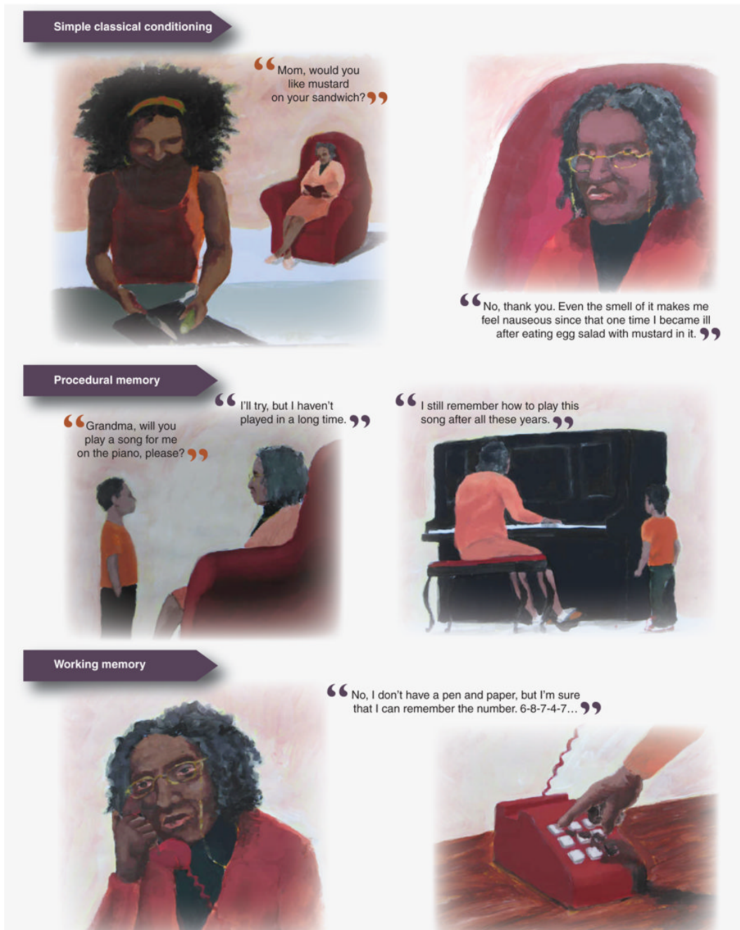
Figure 1. Major memory systems in everyday life.