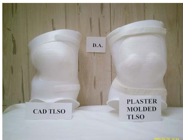
Fig. 1 An example of a standard TLSO and a CAD/CAM TLSO

The CAD/CAM TLSO (Fig. 3) is molded on a modified glass Risser table. The patient is placed on the Risser table in a body stocking and an elastic waist strap is applied. Translucent corrective pads (Fig. 3) are placed, correcting