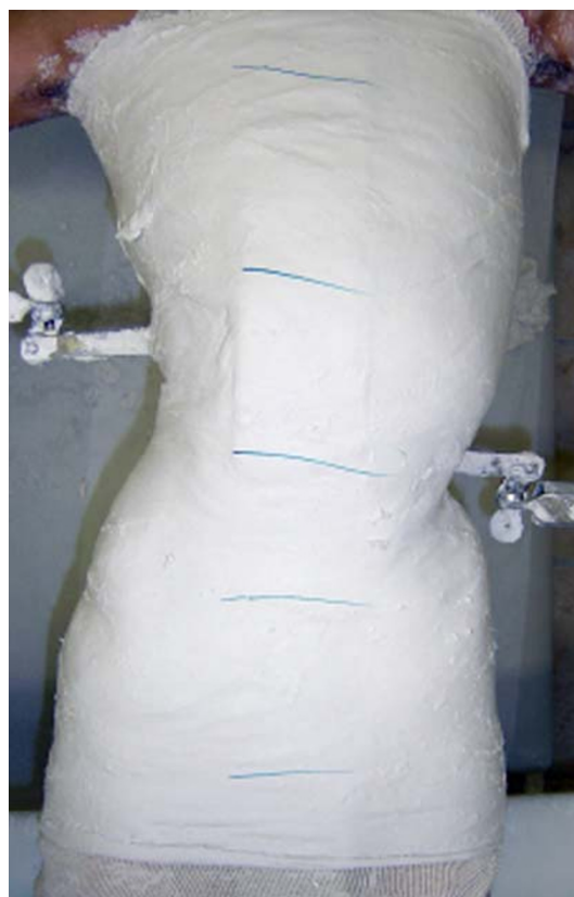
Fig. 2 The standard TLSO is molded on a modified Risser frame using Risser type push pads to correct the deformity

the curve, along with translucent pull straps. Reference positions are indexed with the laser and the patient is scanned in the aligned position. The digital mold is then modified on screen and a model of the torso is manufactured according to the computerized data. The TLSO is vacuum molded with polypropylene in a fashion similar to the regular TLSO.