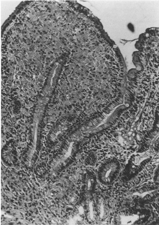
FIG. 1. Duodenal biopsy: pseudo-Whipple aspect with infiltration of the lamina propria. Stain, hematenine-phloxine-safran.

Mycobacterial identification. Mycobacteria were isolated from samples from rectal biopsy, jejunal fluid, blood, and feces at different periods from May to October 1984. Cultures from feces and from a sample of jejunal fluid yielded strains identified as M. avium-M. intracellulare , according to current bacteriological tests and mycolate composition.