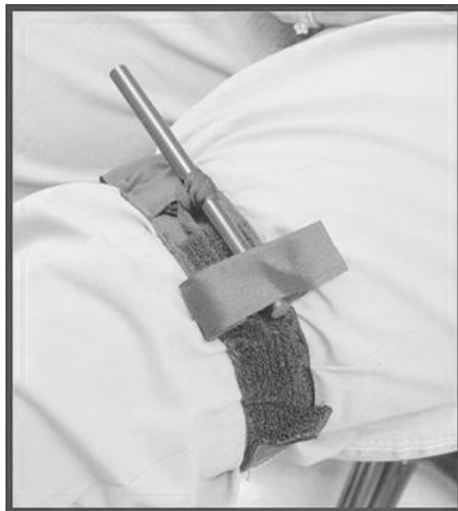
Figure 2 The Combat Application Tourniquet applied to the lower limb.

Principles of tourniquet application include: placement of the tourniquet as distal as possible, but at least 5 cm proximal to