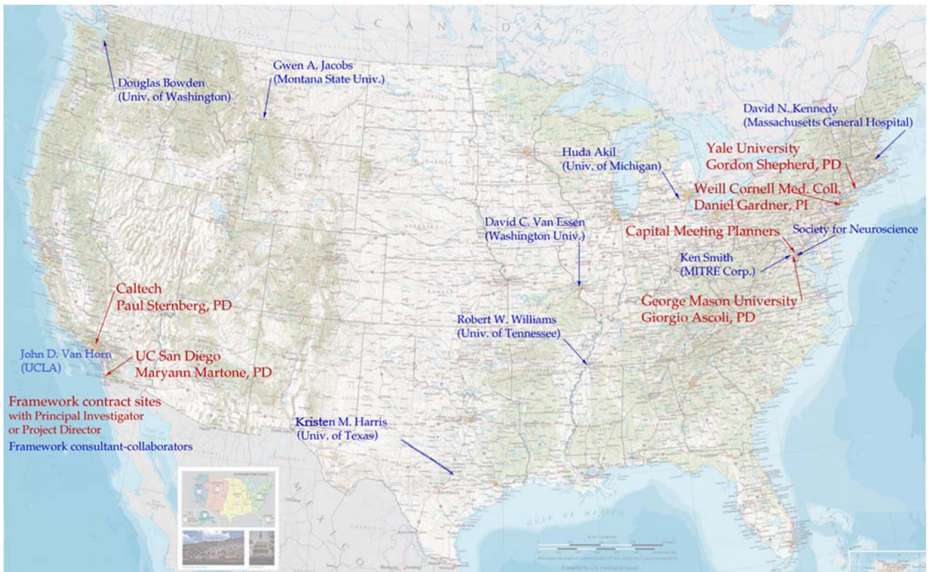
Fig. 1. Framework contributors include both contract sites and volunteer consultant-collaborators. An Appendix lists contributors in greater detail