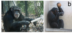
Fig. 2. Photographs of a chimpanzee engaged in (a) simulated termite fishing and (b) simulated nut cracking.