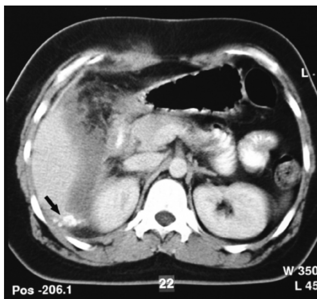
Figure 1 - The computed tomography of the abdomen revealed a complex infra-hepatic abscess (5 x 7 x 9 cm) showing calcified density (gallstones) within the lateral margin (arrow)

A 29-year-old woman was admitted to the hospital with a 4-day history of fatigue, nausea, vomiting, and fever. Her physical examination was unremarkable except for mild abdominal distention without rebound or guarding. The results of standard laboratory tests were within normal ranges, except for the leukocyte count (23 000 cells/UL). The computerised tomography and ultrasonographic examination of the abdomen revealed a complex infra-hepatic abscess (5 x 7 x 9 cm) with a calcified density observed within the lateral margin (Figure 1). The patient's previous medical history revealed that she had medication-controlled diabetes mellitus and had undergone LC in another hospital four weeks prior to hospitalization at our facility. According to consultation with infectious disease specialists, the patient was placed on