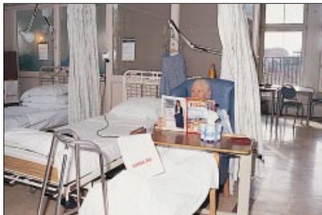
Patients may give mixed messages—reading a holiday brochure does not necessarily mean that the patient is unaware of the prognosis

Many of these questions are rhetorical and have no clear answers. They do, however, give the questioner the opportunity to explore feelings and can help to offload major concerns. Typically, these questions are centred on a search for meaning to make sense of the current situation and may include spiritual issues and questions on religion—beliefs may be strengthened or shaken by the thought of impending death.