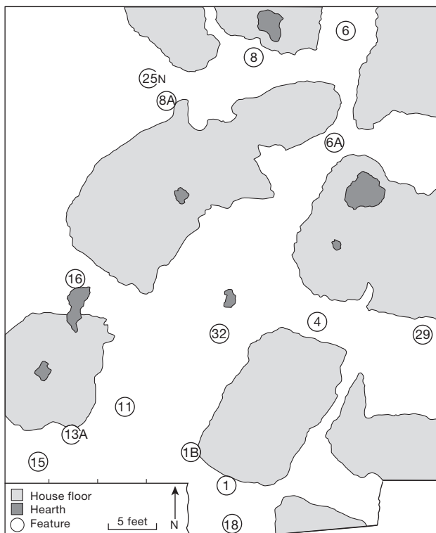
Fig. 2. Unit X block excavation at the Riverton site showing the location of house floors, hearths, and features. Species listed for each feature are from ref. 15 (seed counts listed, nut species listed if present). (Feature 1) Midden deposit: 100 “bony” chenopod, 5 carbonized chenopod, 1 cf. Hordeum sp., 4 elderberry, butternut, walnut, hickory, bitternut hickory, hazelnut, acorn. (Feature 1B) Nutshell concentration (3820 cal B.P.): 207 “bony” chenopod, 4 carbonized chenopod, 2 elderberry, butternut, walnut, hickory, hazelnut. (Feature 4) Midden deposit: 1 carbonized chenopod, walnut, hickory, bitternut hickory, hazelnut, acorn. (Feature 6) Midden deposit: 3 carbonized chenopod, walnut, hickory. (Feature 6A) Midden deposit: 200 “bony” chenopod. (Feature 8) Midden deposit: 1 walnut, hickory. (Feature 8A) Nutshell concentration (3690 cal B.P.): 23 carbonized chenopod, 1 sunflower seed, 11 polygonum, 1 persimmon, 2 Cucurbita rind fragments, butternut, walnut, hickory, bitternut hickory, acorn. (Feature 11) Oval storage pit: bitternut hickory. (Feature 13A) Small pit filled with charred nutshell (3810 cal B.P.): 30 “bony” chenopod, 3 Cucurbita rind fragments, butternut, walnut, hickory, bitternut hickory, acorn. (Feature 15) Burned sandstone concentration: 2 “bony” chenopod, 4 carbonized chenopod, bottle gourd rind fragment, butternut, walnut, hickory, bitternut hickory, hazelnut, acorn. (Feature 16) Midden deposit: 2 “bony” chenopod, butternut, walnut, hickory, bitternut hickory. (Feature 18) Burned sandstone concentration: hickory. (Feature 25N) Midden deposit: 4 carbonized chenopod, 1 persimmon, walnut, hickory, bitternut hickory, acorn. (Feature 29) Circular pit filled with fine gray ash (3620 cal B.P.): 8 carbonized chenopod, carbonized marshelder seeds, hickory, acorn. (Feature 32) Midden deposit: 3 carbonized chenopod, walnut, hickory, bitternut hickory, hazelnut, acorn.

of species that extended over a broad geographical area during the Late Archaic period. Nut-bearing trees, for example, were an important food resource across much of the Oak-Savannah and Oak-Hickory forest regions during the Late Archaic period (9, 16–20), and the Riverton plant assemblage is dominated by nutshells from a variety of tree species, including walnut ( Juglans nigra and Juglans cinerea ), hickory ( Carya sections Carya and Apocarya ), hazelnut ( Corylus cornuta and Corylus americana ), and oak ( Quercus sp.) (15).