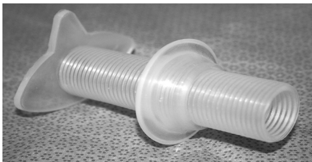
Figure 1 - Photograph of the device

The tube originally described in our first article was remodeled to make it lighter and to provide a more delicate appearance (Figure 1). In brief, it is a corrugated 10 cm long silicone tube (ID, 2.0 cm; OD, 2.5 cm) with three wings at its base. The wings should stay close to the parietal pleura, thus avoiding spontaneous extrusion of the tube. Externally, the tube has a movable ring, which is fixed to the corrugations closest to the chest wall, thus preventing it from falling into the pleural cavity. Those corrugations are fashioned in such a way that the ring is allowed to advance smoothly, but is not able to retract ("fish skin").