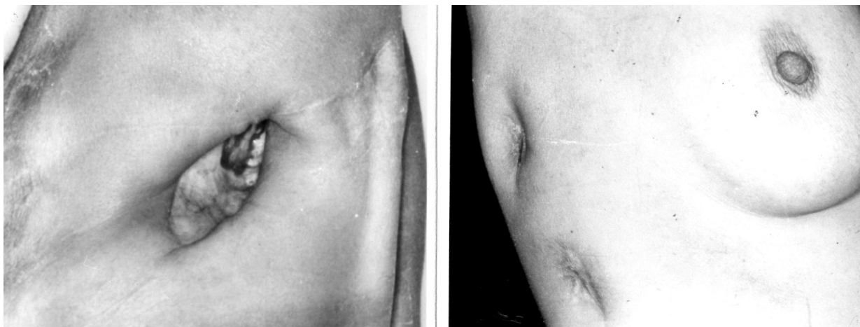
Figure 4 - On the left, a conventional open pleural window scar in a male patient. On the right, the upper scar is after POP removal, and below is a scar after removal of a regular 36 FR chest tube

In the present study, treatment of chronic empyemas with POP provided the same results we used to observe when performing the large OPW, both in terms of infection control and lung re-expansion. The use of this new device, however, offers additional advantages over the conventional operation: 1) insertion takes only about 20 minutes, compared with at least 60 minutes usually necessary to create a large pleurostoma; 2) it can be done under local anesthesia; 3) it does not require multiple postoperative dressings or the close attention of nurses. The main advantage for the patient, however, is that the use of POP precludes major chest wall demolition, thus avoiding gross aesthetic compromise. (Figure 4).