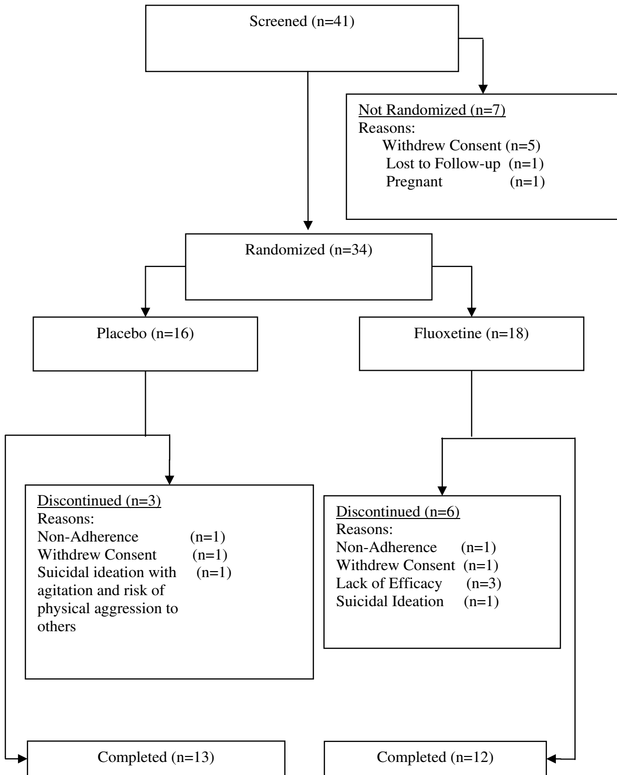
Figure 1 Patient disposition.