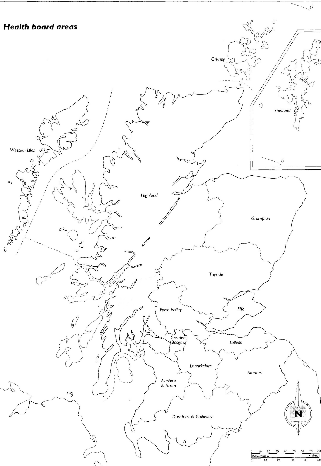
Figure 1 Health board distribution in Scotland.