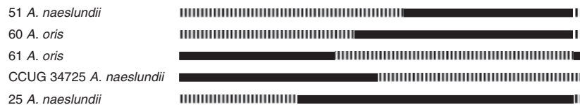
Fig. 2. Recombination events found in nanH of Actinomyces oris strains 60 (EU805671) and 61 (EU805672) and Actinomyces naeslundii strains 51 (EU805620), 25 (EU805612) and CUG 34725 (EU805609). Solid line indicates portion of sequence derived from nanH of A. naeslundii and broken line indicates portion of sequence derived from nanH of A. oris . Insertion in strain 25 between 365 and 1038, in strain 51 between 629 and 1038, in strain 60 between 1 and 477, in strain 61 between 432 and 1038 and between 1 and 655 in CUG 34725. Breakpoints determined using RDP suite of programs with significant evidence ( P < 0.001 ) for recombination obtained with \geq 5 recombination tests in all cases.

of these two species together using the seven programs within the RDP suite and found that only A. naeslundii strains 25, 51 and CCUG 34725 and A. oris strains 60 and 61 gave significant evidence of recombination. The recombination events are summarized in Fig. 2. In the A. naeslundii strains 25, 51 and CCUG 34725 and A. oris strain 60 the recombination event extended beyond the available partial sequences.