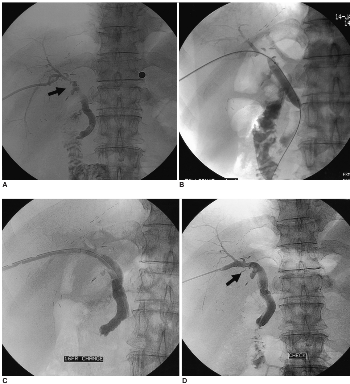
Fig. 2. A 56-year-old man with choledocho-choledochostomy after living donor liver transplantation. A. The cholangiography obtained during transhepatic insertion of a biliary drainage catheter shows a biliary anastomotic stricture (arrow). B. An 8 mm diameter balloon catheters was positioned through the anastomotic stricture. C. A percutaneous transhepatic cholangiographic catheter (16 F) was inserted after biloplasty. D. The cholangiogram after the large profile catheter maintenance method (2 months) shows patent bile ducts (arrow), with excellent flow of contrast medium into the duodenal loop.

All of the patients' clinical and radiologic data were