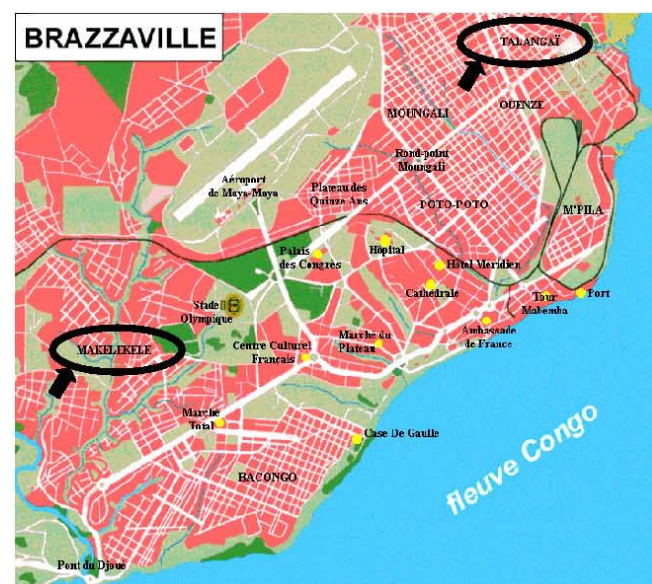
Figure 1 Brazzaville map, Republic of Congo, 2004.

A total of 1115 persons were admitted to the MSF program between January 1, 2002 and April 30, 2003. Among them, 178 patients met the following criteria: 1) Women aged more than 15 years; 2) raped by an unknown person(s) wearing military clothes; 3) admitted to the MSF program between the 1/1/2002 and the 30/4/2003; and 4) and living in Brazzaville. Among these 178 women meeting the inclusion criteria, 19 refused psychological