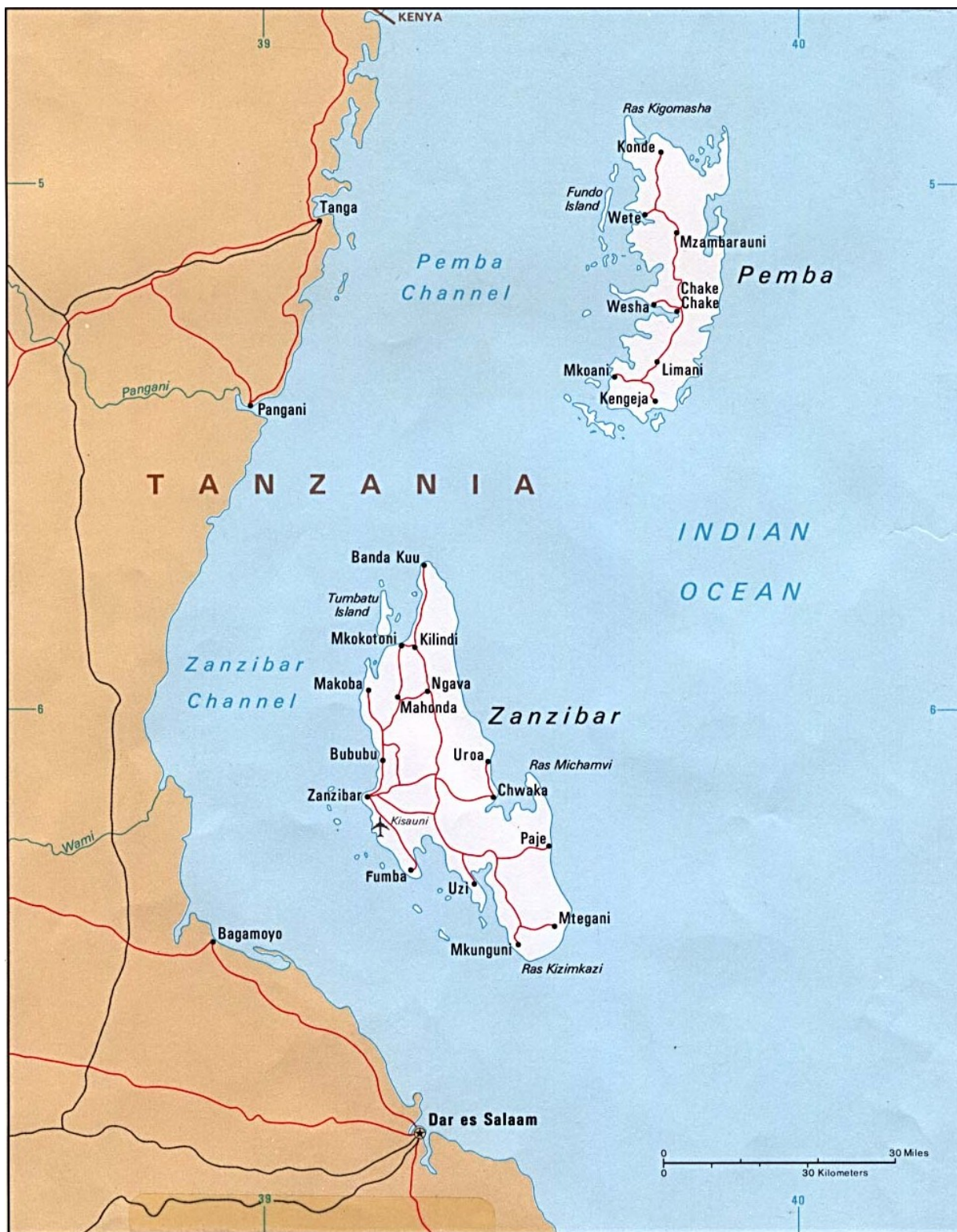
Figure 1 Map of Zanzibar with the two main islands.