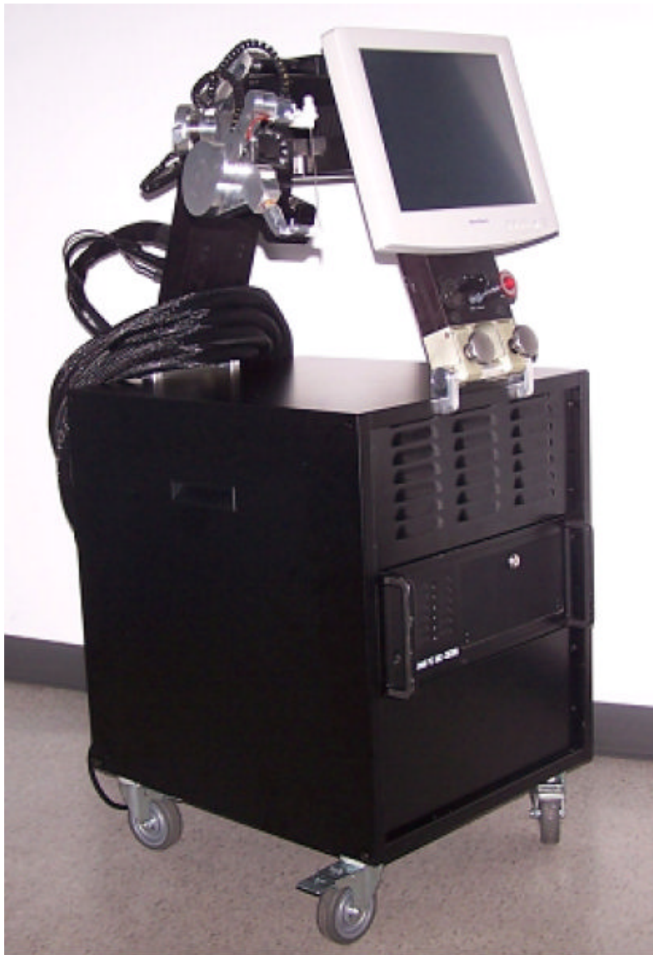
Figure 2. Revolving Needle Driver on the AcuBot robot