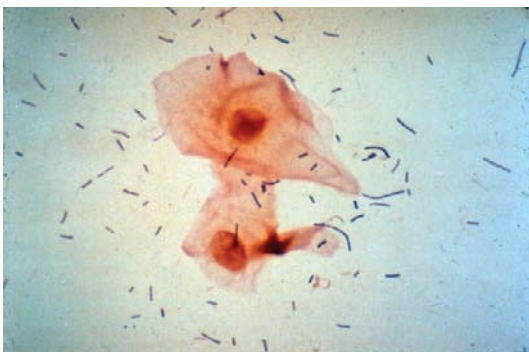
Figure 1. Gram stain of normal vaginal contents (original magnification, \times 400 ). Note predominance of Lactobacillus species that produce hydrogen peroxide, organic acids, and bacteriocins that suppress growth of other species.

A number of biochemical and microenvironmental changes have also been described in BV. 8-10 The normal vaginal epithelium is covered by a thin layer of mucin. In BV, this