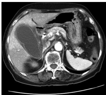
Figure 1 Abdominal CT scan revealing a markedly enlarged and distended gallbladder with a thickened wall.