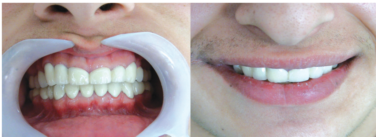
Figure 4. Intraoral and extraoral views of the prostheses.