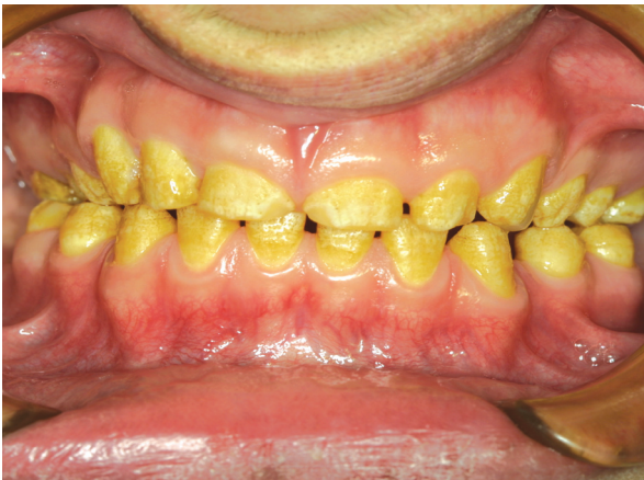
Figure 1. Pretreatment view of teeth in occlusion.

20 years old male patient referred to the Department of Prosthodontic Dentistry in Ataturk University for aesthetic and tooth sensitivity complaints. His medical history and general physical condition were unremarkable. His hair, skin, and nails appeared normal. The pregnancy and the post-natal period had been uneventful. Patient's parents were examined and showed unaffected permanent dentitions. No evidence of a similar condition could be elicited in the family