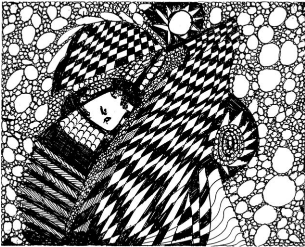
Figure 1. Madge Gill, untitled pen drawing (female face). Courtesy Roger Cardinal.

produced by people whose mental lives are at odds with the norm, or who have been physically afflicted in some deeply disturbing way, or again whose social status is pitiful and lacking in all comforts. Thus, there has been a tendency to envisage Outsider Art solely in terms of its makers' aberrant biographies, and to insist that its