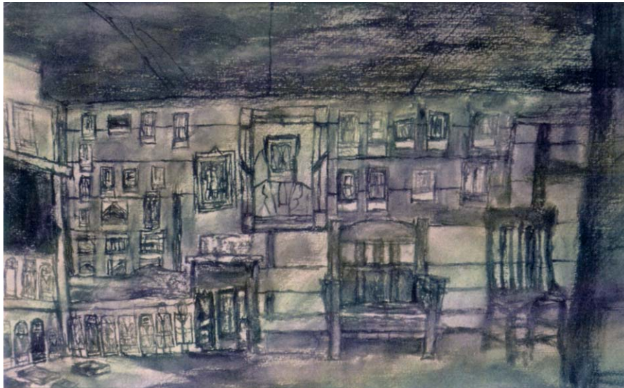
Figure 3. James Castle, untitled drawing in soot and saliva (artist's workplace).