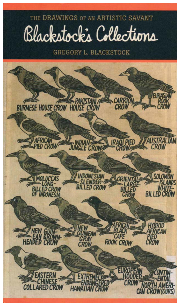
Figure 5. Gregory Blackstock, cover of his book Blackstock's Collections (2006).

Another autistic artist, George Widener (b. 1962), rounds off my brief survey (see Cardinal 2005). Here is another case of amazing savant 'high functioning', for Widener can provide swift answers to arithmetical