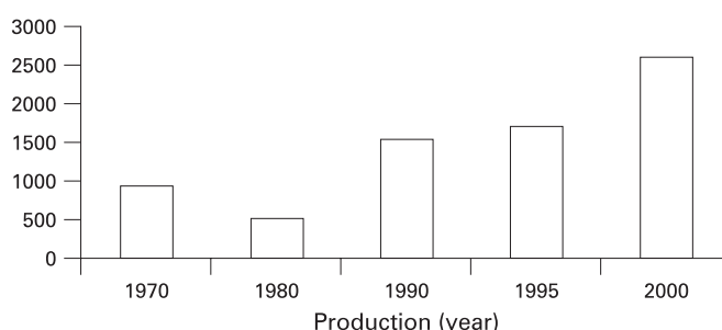
Figure 1 Tobacco leaf production in metric tons, Ghana. 43

In 1978 the 10 major cigarette brands in Ghana were produced with official or nominal retail prices in local currency equivalent to between US$0.67 and US$1.12. 37 45 However the real price at which packs retailed was considerably higher, at between US$1.49 and US$3.72. 37 By 1987 however, BAT market survey data indicate that popular brands were selling for the equivalent of $0.83 to $1.67 per pack (figures again quoted in US dollars by BAT), 49 50 and by 1995 the prices paid per pack of 20 of BAT's top 4 brands (State Express 555, Embassy, Tusker and Diplomat) were $3.50, $2.90 $1.80 and $2.60 respectively. 51 52 Current (2008) retail prices of manufactured cigarettes on sale in Ghana range from the equivalent in local currency of approximately $0.85 to $3.50. Tax on tobacco products in Ghana is high in comparison with other consumer products, but