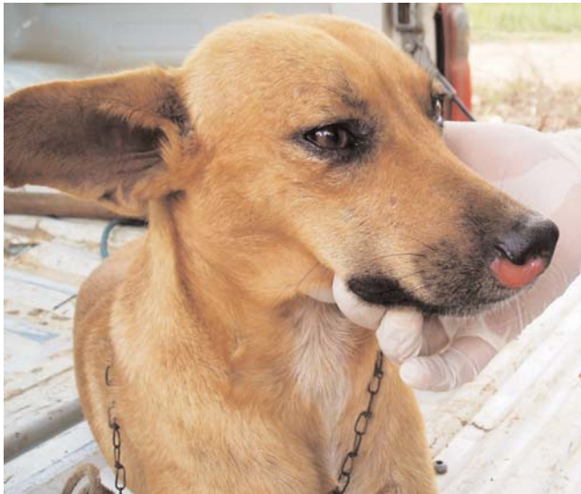
Figure 2 - Canine cutaneous leishmaniosis.

A Leishmania -seropositive dog presenting a mucocutaneous lesion on nose.