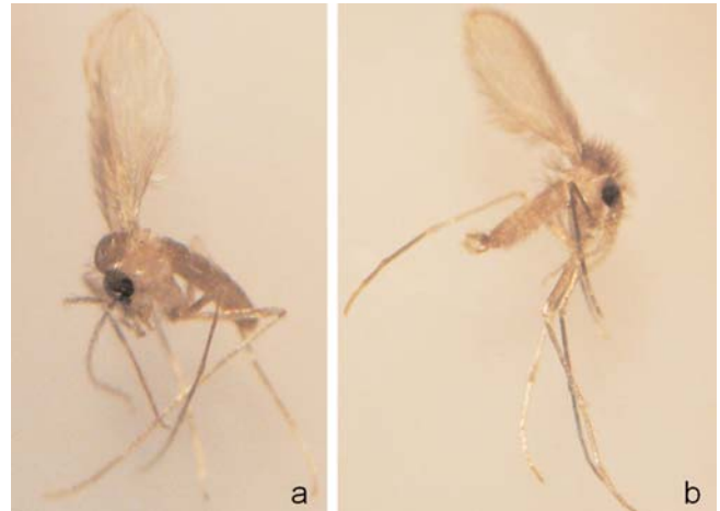
Figure 3 - Lutzomyia sand flies.

The primary mode of transmission of Leishmania parasites from dog to dog is through the bite of an infected phlebotomine sandfly. In South America, the vectors of