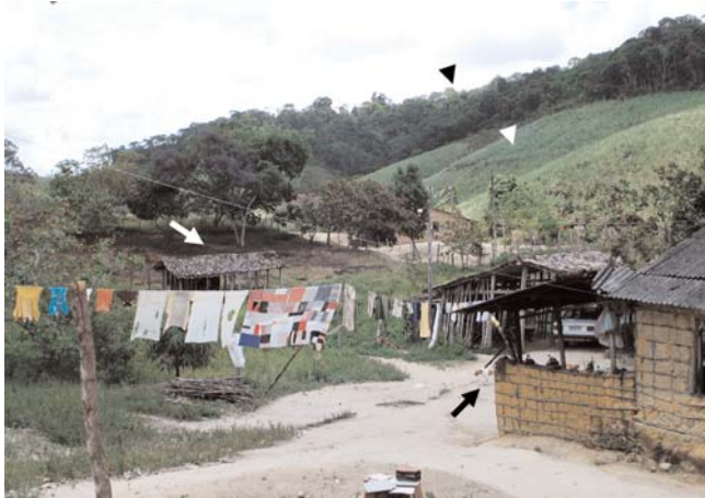
Figure 5 - Dog's lifestyle can increase the risk of Leishmania infection.

This picture shows a free-roaming dog (black arrow), an animal shelter (white arrow), a spot of modified Atlantic rainforest (black arrowhead), and an area of deforestation (white arrowhead) for agriculture. In this rural area, dogs are highly exposed to sand flies, which can be found inside houses, in animal shelters and forested areas.