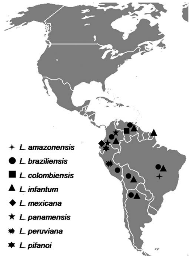
Figure 4 - Distribution of Leishmania spp. infecting dogs in South America.

For a long time, canine leishmaniosis was considered to be a disease confined to rural areas. Nowadays, the disease is well-established in large urbanised areas such as the metropolitan region of Belo Horizonte, south-eastern Brazil [42]. Many factors could favour the spreading of canine leishmaniosis in South America, including the movement of dogs between endemic and non-endemic areas [31] and changes in vector ecology. Lutzomyia longipalpis is widespread in South America [23] and it is adapted to colonise environments modified by man [24]. In the State of Pernambuco, north-eastern Brazil, sparse spots of modified Atlantic rainforest can be found in highly urbanised areas. These remnants of Atlantic rainforest are potentially inhabited by phlebotomine sandflies of many species [43], including Lu. longipalpis [44]. It means that the introduction of a Leishmania -infected dog into a non-endemic area where the potential vectors are present could result in the establishment of a new focus of disease. In fact, if the current tendency continues [40,41], new foci of the disease should be expected to be detected in the future.