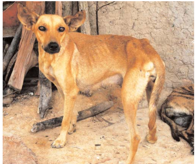
Figure 1 - Canine visceral leishmaniosis. A Leishmania -seropositive dog showing facial muscular atrophy, skin lesions, loss of weight, and onychogryphosis.

Leishmania infantum is the most important causative agent of canine visceral leishmaniosis in South America. Dogs have been regarded as the main reservoir hosts of L. infantum , which is a parasite of major zoonotic concern, particularly in Brazil where ~3500 cases of human visceral leishmaniosis are reported annually; about 10% of the cases have resulted in a fatal outcome [13]. Dogs infected by L. infantum can develop a life-threatening disease characterised by lymphadenomegaly, muscular atrophy, skin ulceration, weight loss and onychogryphosis (Figure 1). It is a common concept that all dogs with visceral leishmaniosis in South America are infected by L. infantum . However, in Venezuela, a strain characterised by isoenzyme analysis as L. colombiense was isolated from a dog presenting visceral leishmaniosis [7]. In Brazil, two dogs diagnosed as having visceral leishmaniosis were actually infected by L. amazonensis [12]. These reports highlight the importance of using proper diagnostic tools