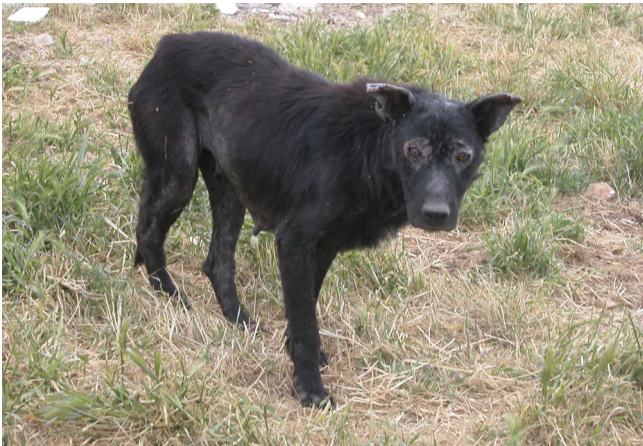
Figure 2 - Dog showing severe clinical signs of leishmaniosis.

A dog from southern Italy positive for Leishmania infantum both at the parasitological and serological tests presenting poor general conditions.