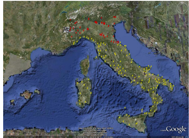
Figure 4 - Current distribution of Leishmania infantum in Italy before and after 1989.

As a further issue, new tools for monitoring and diagnosing CVBD (molecular technologies, mathematical models, remote sensing and geographical information