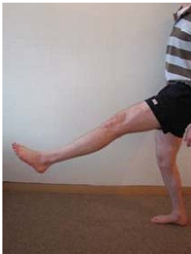
Figure 4 Dynamic Stretch. Participants actively swung the leg to be stretched forward into hip flexion until a stretch was felt in the posterior thigh whilst keeping their knee extended and their ankle in plantarflexion. This was repeated for 30 seconds, and repeated 3 times.

There was no main effect for group ( p = 0.462 ), with the mean values not being significantly different at any interval (all p > 0.05 ). (Table 1). Using ANCOVA to adjust for the non-significant ( p = 0.141 ) baseline differences, the