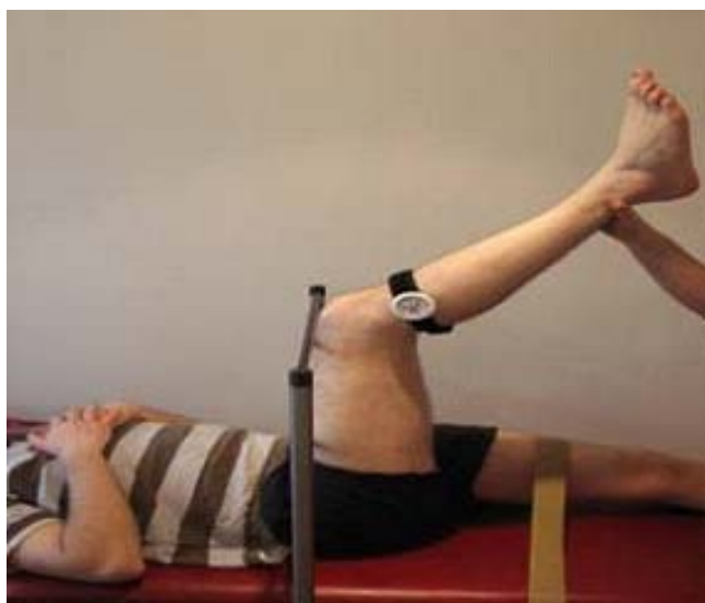
Figure 2 Measurement of hamstring flexibility. Passive Knee Extension Range of Motion (PKE ROM) was assessed with a Myrin goniometer. This procedure was repeated 3 times for each leg at all intervals and an average of all 3 measures was taken as the mean flexibility score.

After randomly allocating the subject to the order of stretching days, baseline flexibility (B), as determined by PKE ROM, was measured in both legs. For the previously injured group, the