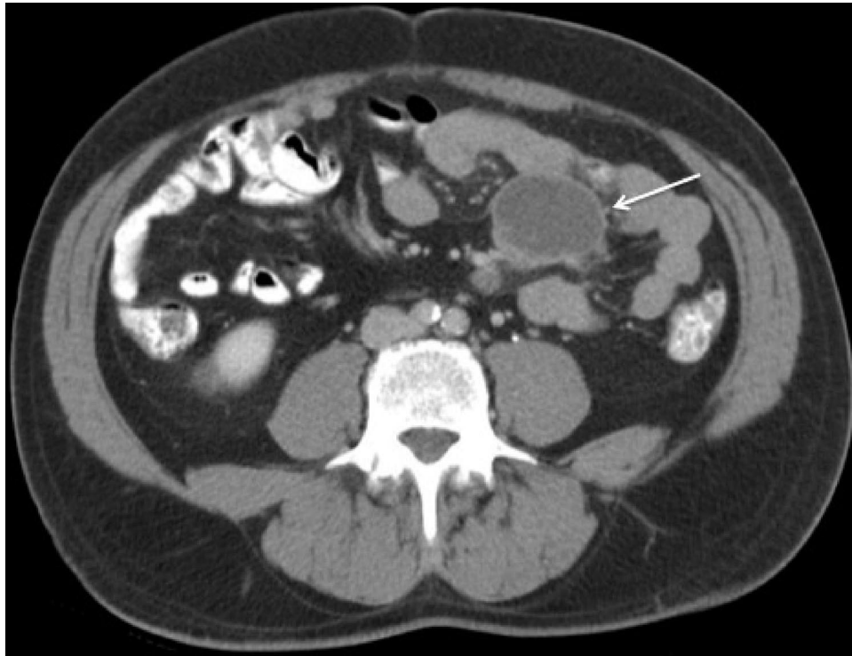
FIG. 1. Abdominal CT scan of our patient, demonstrating the largest of several mesenteric masses (arrow), measuring 5.1 by 3.6 cm.

largest of which measured 4.5 cm. A partial small bowel resection, including removal of the associated mesentery, was performed.