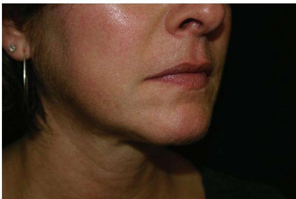
Figure 3 24 hours after Juvéderm™ Ultra to right Marionette line.

The longevity of Juvéderm™ Ultra is about 6–9 months and Ultra Plus may last up to 12 months, which is similar to Restylane® and Perlane®. Captique® and Prevelle Silk® are thought to last 4–6 months and the duration of Puragen® is unknown at the time of publication of this article. Both Juvéderm™ products are packaged in 0.8-mL syringes as a clear gel and are stored at room temperature with a shelf-life