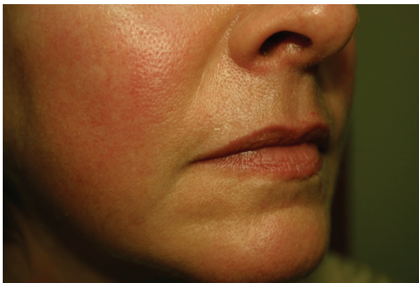
Figure 2 Before Juvéderm™ to the Marionette lines.

completely hydrated with water in the syringe, and HA is well known to be able to bind 1,000 times its weight in water, Juvéderm™ will absorb water after injections and thus slightly expand within 24 hours after correction. The patients can thus be informed, that the effect will be “even better” 24 hours after the injection. However, it is important to consider this feature in clinical practice, especially when injecting the body of the lips, therefore one should always undercorrect to allow for expansion. Restylane® and Puragen® are also not completely hydrated in the syringe, whereas Captique®, Hylaform®, and Prevelle® are completely hydrated and will not expand after injection.