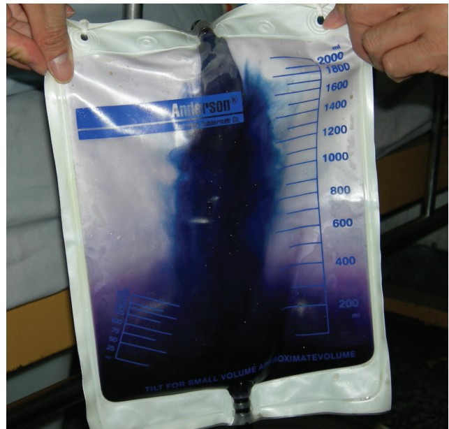
Figure 3 The longer the PVC bag stayed in use for a patient, the deeper the color purple the bag became, despite changing sterile PVC urine bags from 2 different companies.

femoral neck about 3 years ago. He suffered from PUBS off and on for 10 months. He regularly took doxazosin mesylate (Doxaben®) 1 mg per day for hypertension and BPH, and quetiapine fumarate (Seroquel®) 100 mg per day for vascular dementia with delirium.