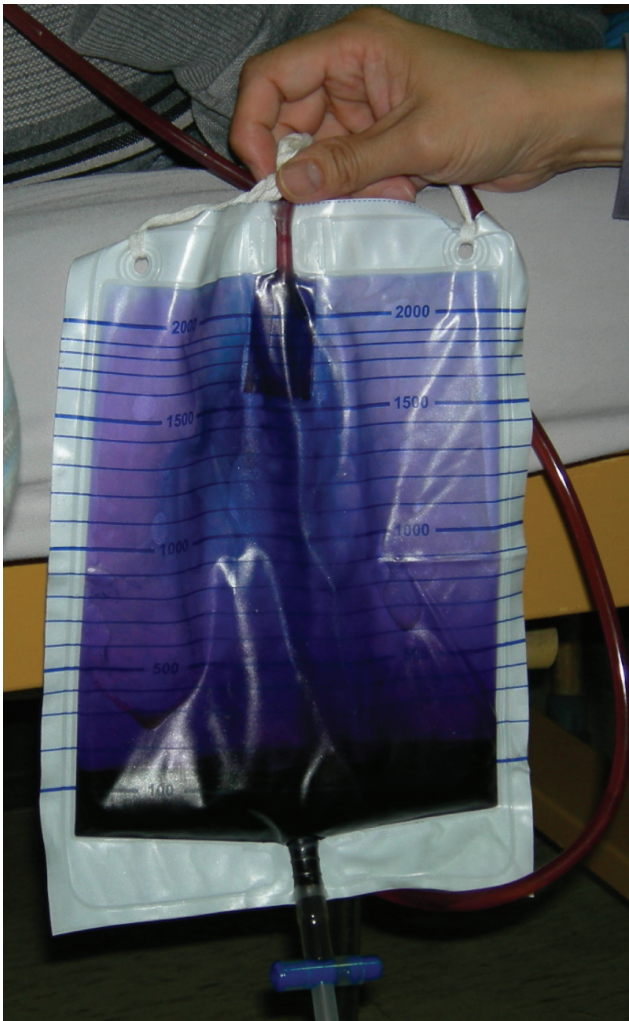
Figure 2 The urinary catheter drainage system with changing color from red to purple and sometimes with differently colored tube and bag in case 3 with purple urine bag syndrome.

Case 5, an 80-year-old male, had been a patient with vascular dementia (VaD) with delirium since 2 years ago. He had also suffered from hypertension and BPH for 20 years. He became long-term bedridden because of fracture of the left