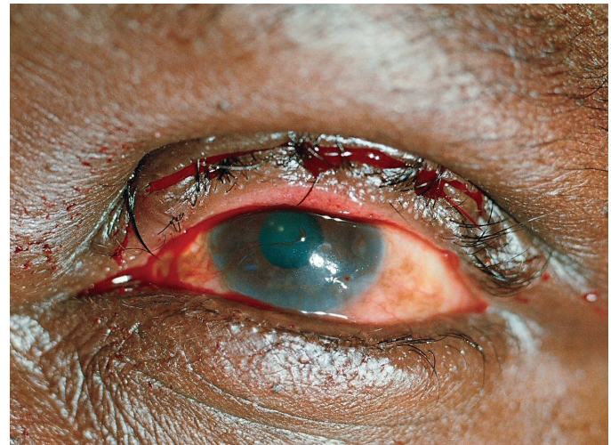
Figure 4. The final result