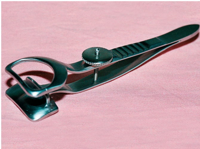
Figure 1. The new lid rotation clamp