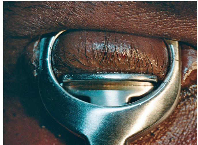
Figure 2. The clamp in place; a mark at 3 mm shows where to cut