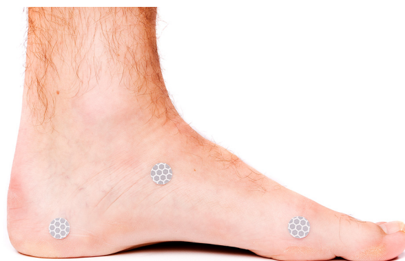
Figure 1 Reflective marker positions used to calculate navicular drop (ND).

The foot length was measured with a ruler from the most posterior aspect of calcaneus to the tip of the longest toe. The foot length ranged from 21 – 31 cm (table 1). Custom made flat markers with a diameter of 13.5 mm made from reflective 3 M scotch tape were used. The markers were placed while participants were seated with the subtalar joint in a neutral position. Neutral position of the subtalar joint was defined as the position where talus could be palpated equally on the medial and lateral side of the foot [18]. An experienced clinician placed the markers with adhesive tape on (i) the navicular tuberosity, (ii) medial aspect of calcaneus 2 cm above the floor and 4 cm from the most posterior aspect of the calcaneus, and (iii) medial aspect of first metatarsal head 2 cm above the floor (figure 1).