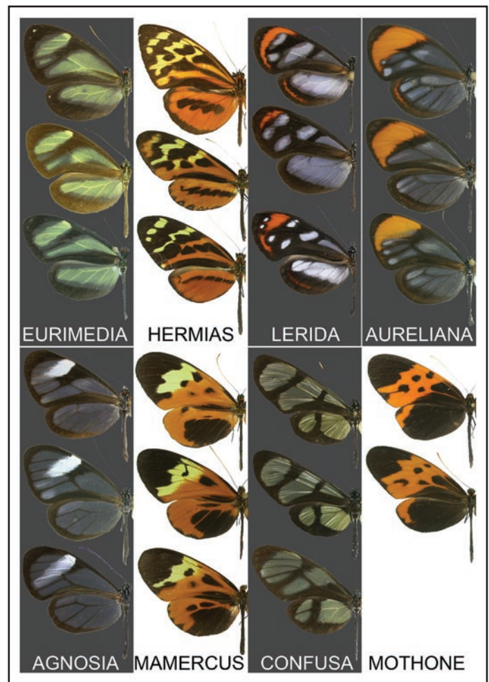
Figure 1. The eight mimicry rings of the study community, illustrated by several species (eurimedia: Ithomia salapia , Pteronymia primula , Napeogenes inachia ; hermiias: Tithorea harmonia , Mechanitis polymnia , Melinaea satevis ; lerida: Oleria gunilla , O. onega , Hyposcada illinissa ; aureliana: Pseudoscada florula , Napeogenes sylphis , Hypoleria lavinia ; agnosia: I. agnosia , Heterosais nephele , Pseudoscada timna ; mamercus: Hypothyris mamercus , N. larina , H. moebiusi ; confusa: Methona confusa , M. curvifascia , Callithomia lenea ; mothone: Melinaea marsaeus , Mechanitis mesenoides ). Species with transparent wings are presented against a dark background.

Considering positive interaction might lead to novel interpretations of existing data sets. For example, if mutualistic species tend