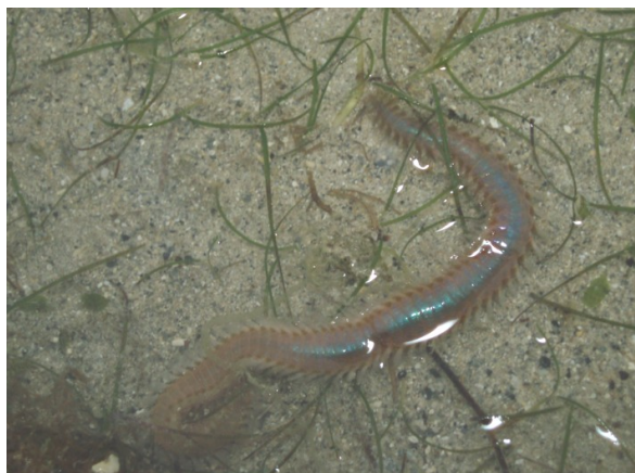
Figure 2: Marine fireworm Eurythoe complanata (body length 10 cm).

thus, the biological properties of complanine can be understood as controlling this cascade [2].