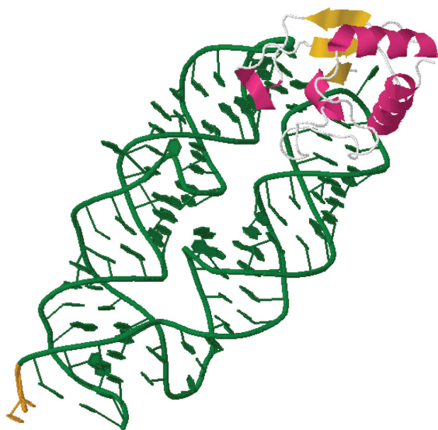
Figure 3. An example of how PDB structures are displayed in Rfam. In this case, the structure 1l ng, containing the SRP19-7S.S RNA Complex from M. jannaschii , is rendered as cartoons using Jmol. Protein regions are coloured using the following scheme: beta-sheets (yellow), helices (magenta) and unstructured regions (white). RNA bases that match the Rfam model are coloured according to the key given in the web page (not shown here). In this structure, green represents a match to the eukaryotic SRP model, whereas those unmatched bases are coloured orange.

latest version to prepare the next major release of Rfam. Testing suggests that, compared with the version used for Rfam 9 (v0.72), v1.0 is faster and slightly more sensitive, whilst introducing for the first time E -values for hits returned from database searches. Although the speed increase will not be sufficient to obviate the need for BLAST filters in the Rfam production pipeline, this remains a major goal for Infernal development. Importantly, Infernal v1.0 is not compatible with the Rfam 9 CM files. Rfam/Infernal users may wish to generate new CMs from Rfam 9 SEED or FULL alignment files.