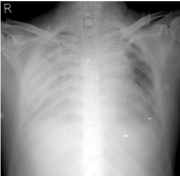
Figure 1. Chest X-ray showed diffuse reticulonodular opacities in both lungs and pulmonary edema.

examination revealed bilateral crackle in the basal lung and a chest x-ray which revealed pulmonary edema (Figure 1). These symptoms improved following the intravenous infusion of the furosemide and dobutamine.