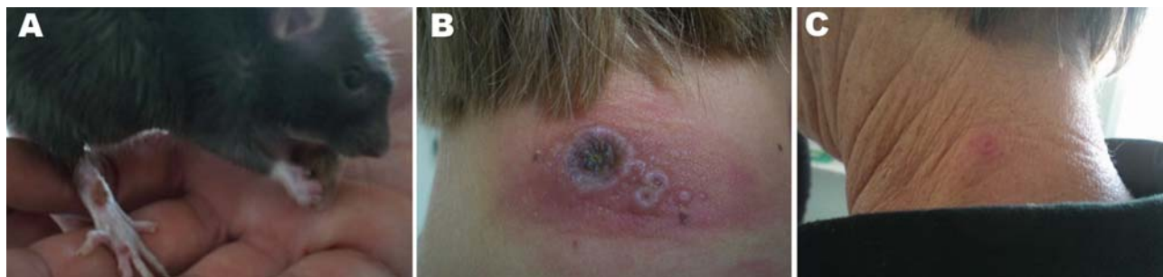
Figure 1. Cowpox lesions on rats and humans during an outbreak in Germany, 2009. A) Rat named Shiva (strain named after this rat) with lesions on the right hind limb; it died 1 day later. B) Neck lesions of a girl without previous vaccinia virus (VV) vaccination. C) Neck lesion of the girl's grandmother with a history of VV vaccination. Photographs taken by authors 13 days after purchase of the rats. Patient is the grandmother (patient no. 4); rat is rat no. 2.

4 rats before purchasing another rat from the infected litter. After 35 days, skin lesions developed in all of her rats, including the initially asymptomatic index rat. All were euthanized due to clinical suspicion of OPV. Fortunately, the kidney transplant patient without previous VV vaccination did not develop signs or symptoms suggestive of CPXV infection. Nevertheless, we collected a blood sample and swabs from her throat and a recent rat-bite finger wound.