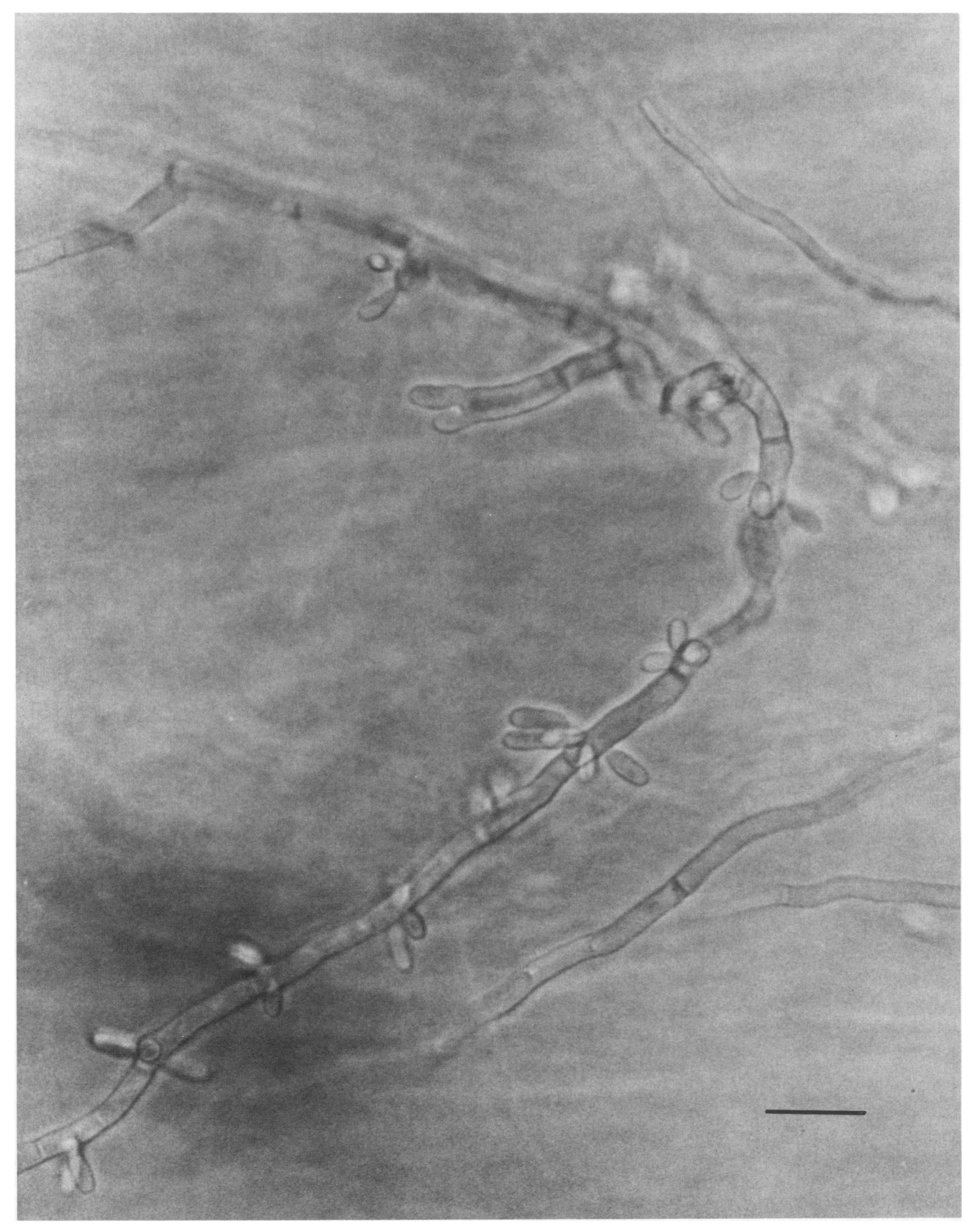
FIG. 2. Cornmeal agar slide culture of mold isolated from abscess tissue homogenate, showing blastoconidia typical of A. pullulans. Bar, 20 µm.