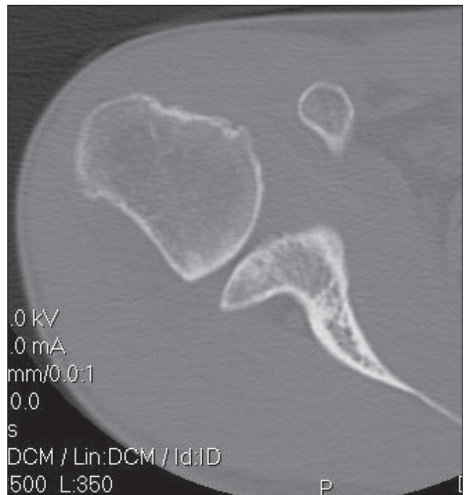
Fig. 3. Axial computed tomography scan identifying large Hill-Sachs and bony Bankart lesions.

Several studies have demonstrated the important role that glenoid bony defects can play in recurrence. Burkhart and colleagues 1 found that a glenoid with an inverted pear shape led to a 67% failure rate of the soft tissue Bankart