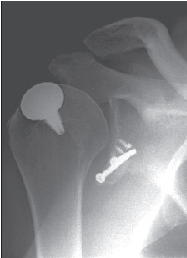
Fig. 2. Postoperative radiograph showing the implant in proper position and the coracoid transfer bony block.

At 1 year follow-up, the patient was doing well without recurrence and enjoyed 120° of forward elevation, 30° of external rotation in abduction and T12 internal rotation.