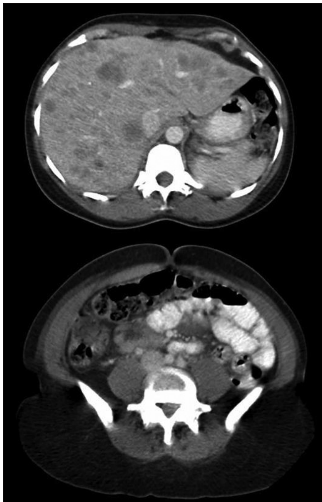
Fig. 1. Computed tomography scan with medium contrast showing (top) multiple liver metastases in both lobes of the lungs and (bottom) the cecal mass.

The first study that introduced the term “large-cell neuroendocrine carcinoma” was by Bernick and colleagues. 4 In his series, 0.6% of patients with colorectal cancer were affected by neuroendocrine carcinomas and 0.2%