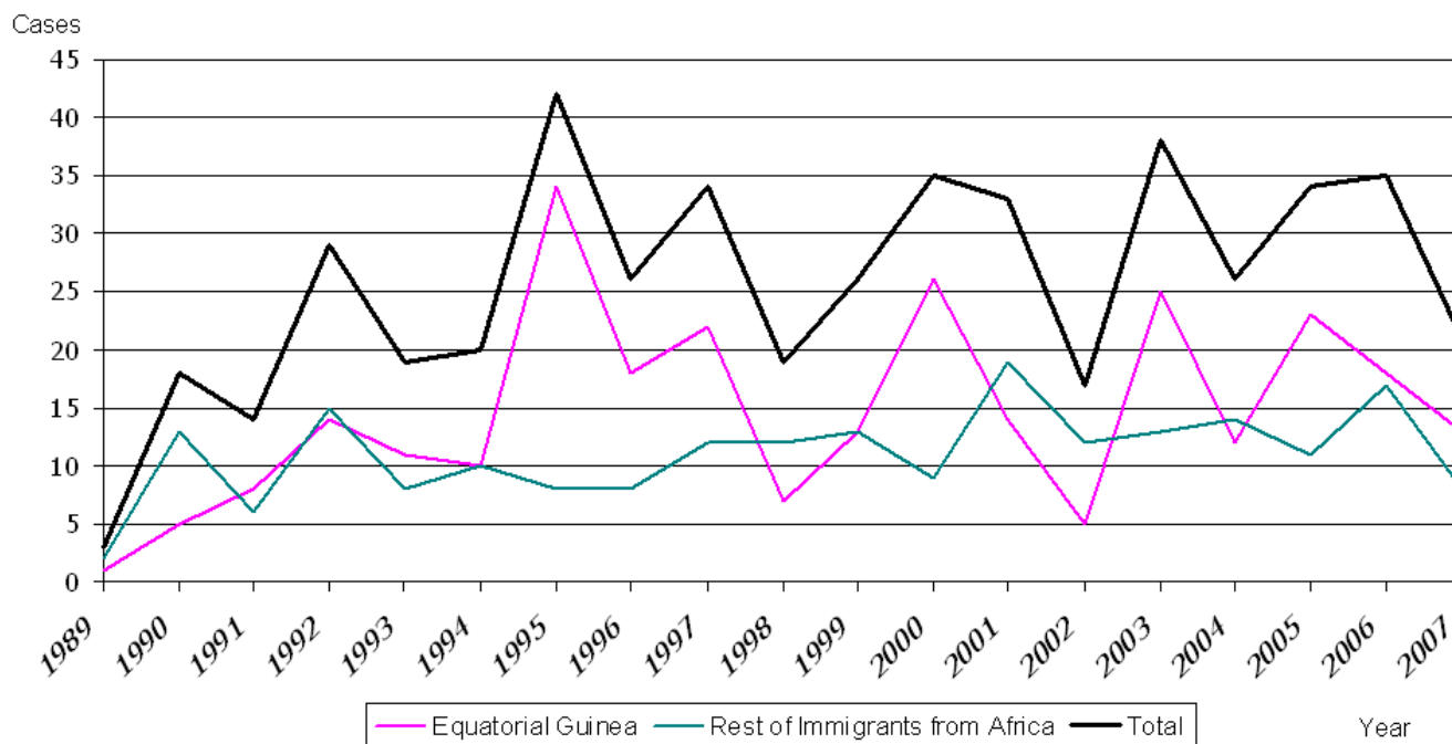
Figure 2 Evolution of the recorded malaria cases. Patients from Equatorial Guinea compared to other Africans. Barcelona, 1989–2007.

the rest of Africa. Moreover, it was possible to observe that this group requires less hospitalization and visited the specialized center in the Inner City (UMTSID) more often, even though they live in less economically disadvantaged neighbourhoods (Table 2).