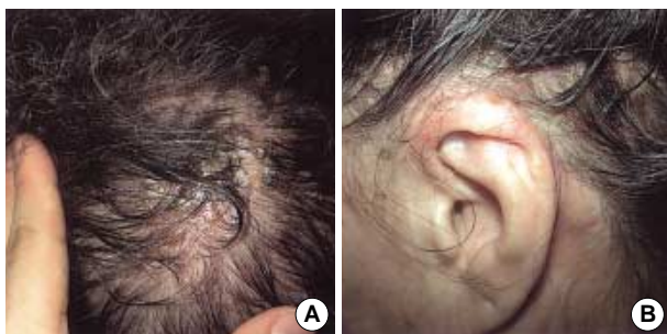
Fig. 1. Erythematous papules with crusts and erosions on the left scalp and left ear lobe.