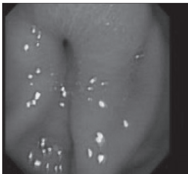
Figure 1) Opening of gastrocutaneous fistula seen at gastrostomy site

Les auteurs présentent un cas de fistule gastrocutanée qui s'est formée après l'installation d'une sonde de gastrostomie endoscopique percutanée. On a d'abord adopté un traitement classique de la fistule, qu'on a ensuite fermée par photocoagulation au laser argon et installation de pinces endoscopiques. Le patient, maintenu en observation, a obtenu son congé une fois la fistule fermée.