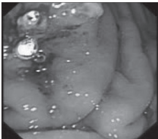
Figure 3) Superficial mucosal ulcers after application of argon plasma coagulation

increase gastric emptying, increase gastric pH and decrease intragastric pressure (3,4). Kobak et al (3) achieved fistula closure in 53% of cases by cauterization with silver nitrate and an H 2 antagonist (3). Others have described the application of collagen plugs, with mixed results (5,6). Several published case series have described the use of cyanoacrylate glue for closure of intractable enterocutaneous fistulas; however, this approach has not been critically evaluated or widely adopted (7,8). Usually, surgical correction is reserved for GCFs intractable to other modalities (9,10).