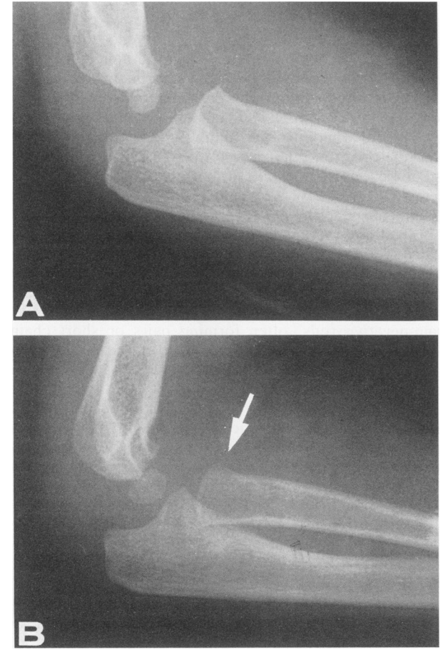
FIG. 2. X rays of the left elbow. (A) Normal bone; swelling of soft tissue. (B) Osteolytic lesion (indicated by the arrow).

joint infections (2, 5–9, 11, 23, 24, 28–30, 33). Most of the patients were previously healthy children.