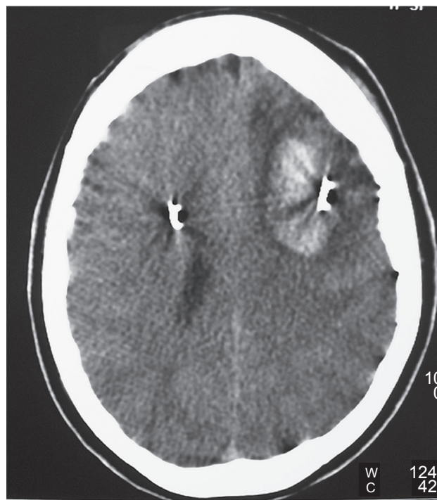
Figure 2 Computed tomography scan taken after the patient's health deteriorated, documenting frontal intraparenchymal hematoma along the trajectory of the definitive electrode.