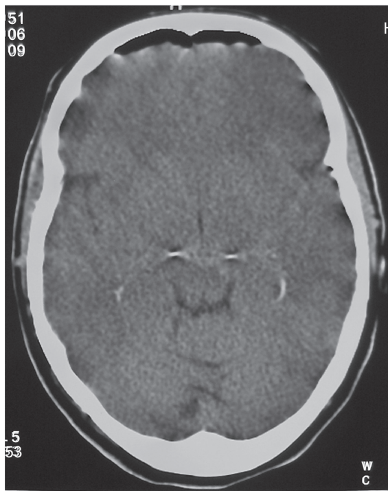
Figure 1 Early postoperative computed tomography scan documenting correct electrodes positioning.

Immediate postoperative neurological status of the patient was followed at the neurosurgical ward and was negative. Four hours after surgery the patient underwent a control CT scan of the brain (Figure 1), documenting correct positioning of the stimulating electrodes. A minimal (less than 0.5 cm) cortical hematoma on the left side with no mass effect was documented. One hour later, right hemiparesis and diminished level of consciousness were noticed, together with a severe dysarthria, and a further control CT scan was obtained: a 3 cm maximum diameter cortical–subcortical hematoma was documented, approximately 25 cc in volume, located in the frontal lobe along the electrode's trajectory, with a significant local mass-effect (Figure 2). After careful discussion considering the absence of midline shift, and the absence of a further worsening of