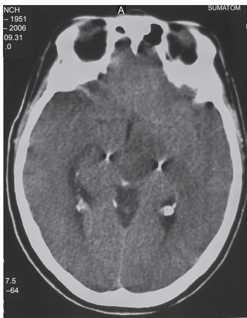
Figure 3 Maximum electrode displacement, as noted on the 13th postoperative day control computed tomography scan.

Intraparenchymal hemorrhage is considered the most important complication related to DBS procedure, although