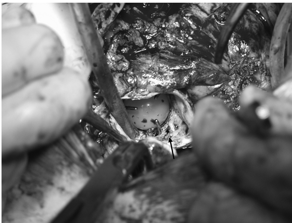
Figure 1 Intraoperative picture of the modified Smeloff-Cutter caged-ball aortic prosthesis with a paravalvular leakage (arrow).

After cannulation of the femoral vessels, cardiopulmonary bypass (CPB) was initiated and the patient cooled down to 18 °C allowing open distal anastomosis of the proximal aortic arch during circulatory arrest. The chest was opened with the heart unloaded by extracorporeal circulation. During cooling the heart was exposed by sharp dissection, the aorta was crossclamped, excised, and the aortic valve removed and replaced by a 27 mm Medtronic Advantage aortic valve prosthesis (Medtronic GmbH, Duesseldorf, Germany). A 25 mm Dacron tube graft was anastomosed to the aorta above the left coronary artery with reimplantation of the RCA. A 10-minute phase of circulatory arrest allowed for safe distal anastomosis of the Dacron tube to the proximal aortic arch. After thorough deairing of the aorta and the left ventricle, cross-clamping was removed (after 109 minutes), rewarming was started and appropriate reperfusion time was allowed. Decannulation, after 220 minutes of CPB, and closure of the chest and groin were uneventful. Total time