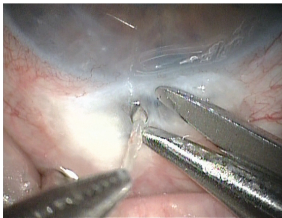
Figure 2 In theatre; note the vitreous strands coming out of the sclerostomy site.

after trabeculectomy 7,8 and the six-month outcomes are encouraging. 7