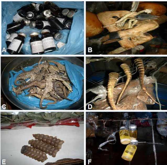
Figure 3 Examples of animal products used as remedies in that are sold in public markets in Crato and Juazeiro do Norte. A: Liver powder of Coragyps atratus , B: Hoof of Mazama sp., C: Dried Seahorses ( Hippocampus reidi ), D: Tail of Euphractus sexcinctus , E: Rattle of Crotalus durissus , F: Fat of Tupinambis merianae (Photos: Samuel C Ribeiro).

asthma, while its fat is used in to treat rheumatism and bruises. The fat from Hoplias malabaricus is utilized in the treatment of inflammations, urinary infections, and ear-aches.