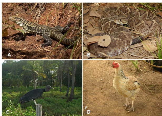
Figure 2 Examples of animals used as medicine that are sold in public markets in Crato and Juazeiro do Norte. A: Tupinambis merianae , B: Crotalus durissus, Gallus domesticus, D: Coryphaps atratus.

The species most frequently cited in the present study were: Tupinambis merianae (n = 20) and P. tuberosus and Crotalus durissus (n = 18) (Figure 2). These species are similarly widely used in alternative medicinal practices in other regions of Brazil [16-18,22,41]. Most of the animal species cited are only found wild in nature; only five