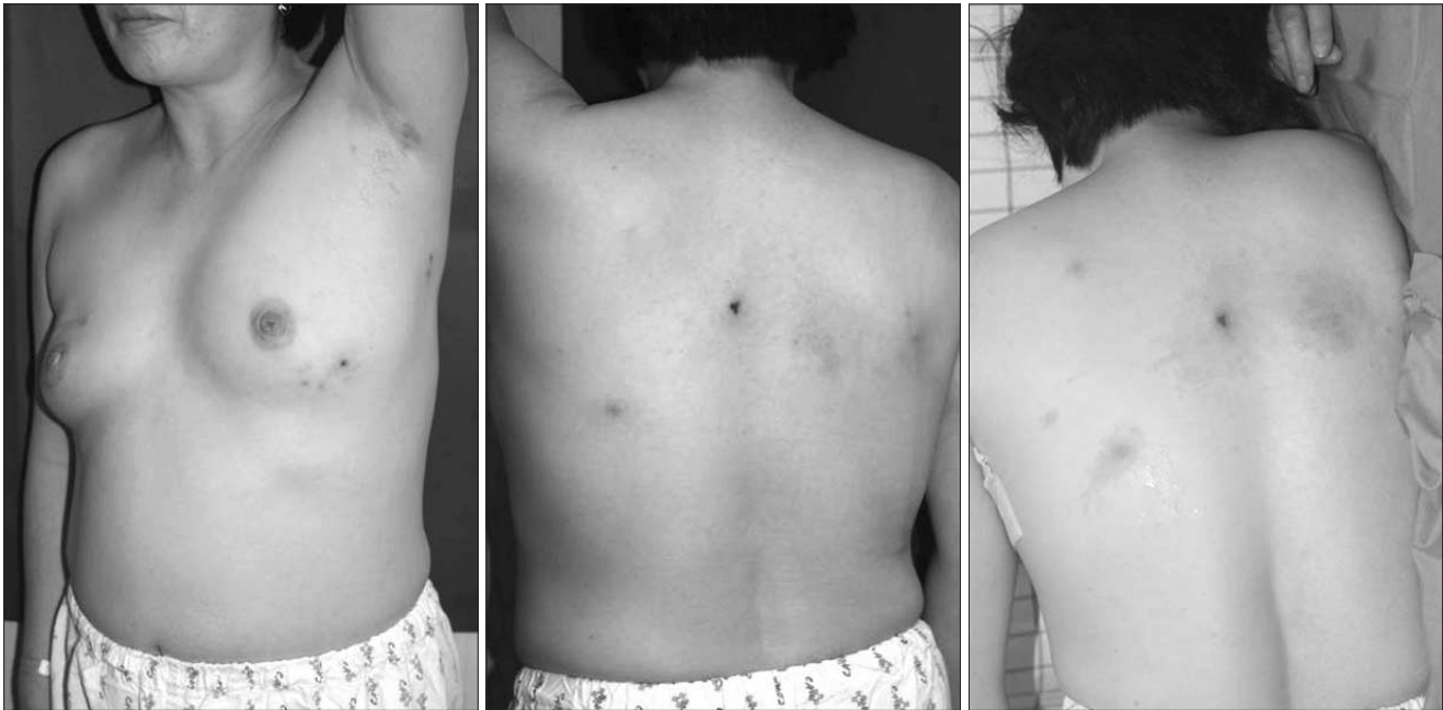
Fig. 1. The grouped erythematous vesicles on the left anterior chest (Lt. T4) and both upper back areas (Rt. T4).